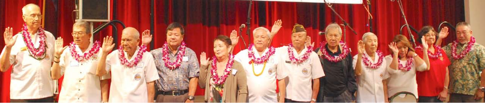
MIS Veterans Club officers for 2016-2017 take their oaths of office