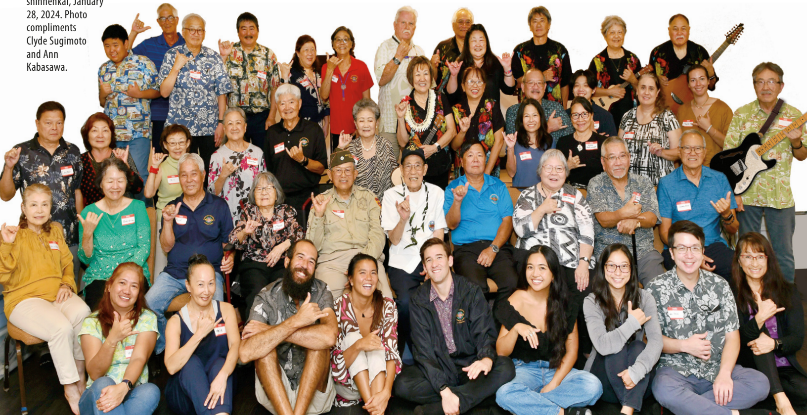
Below: MIS Veterans shinnenkai, January 28, 2024.